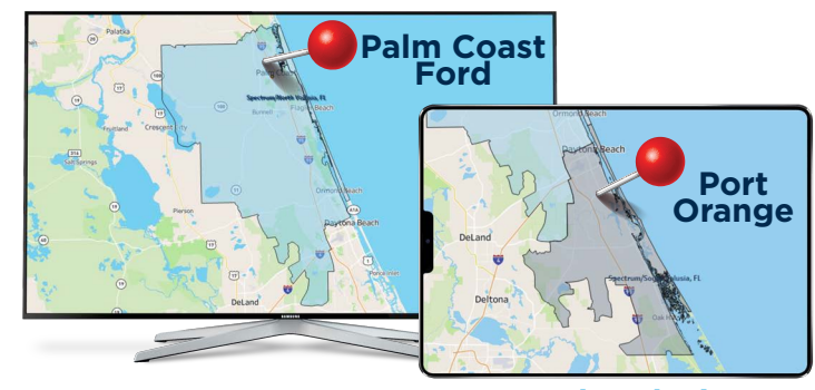
South Volusia (Conquest Market Area)

competitive dealerships in a geography 20+ miles to the south of Palm Coast Ford. That geography is represented by the South Volusia Spectrum Reach Zone. Port Orange, is a prospect-dense area within South Volusia that is ripe for conquest sales.